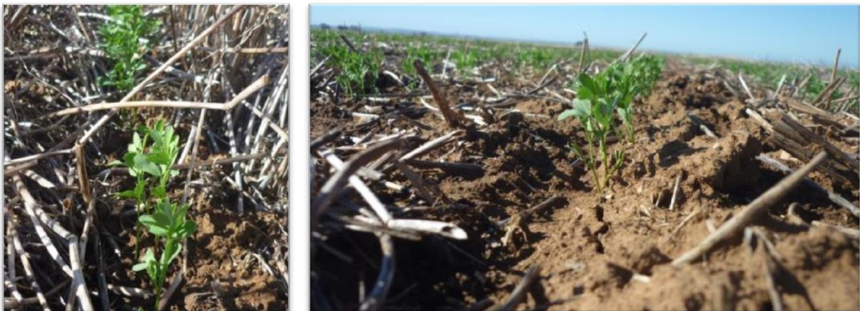
Photo: Hart lentil trials at Pinery in 2014.