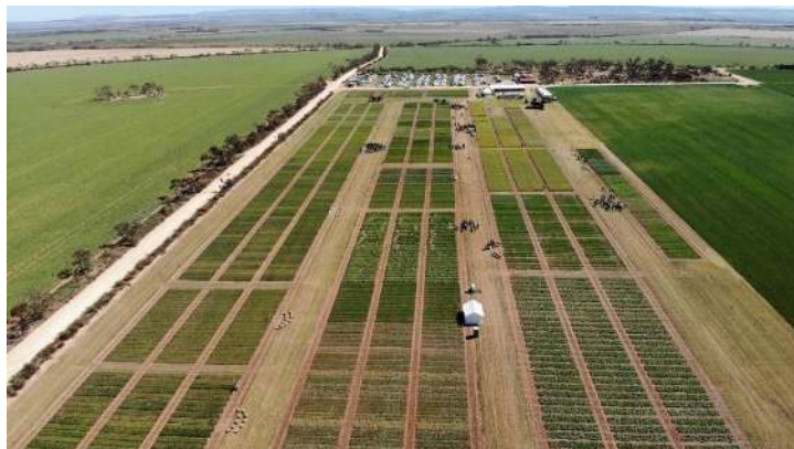
Hart Field Day 2019 - Quarter 1