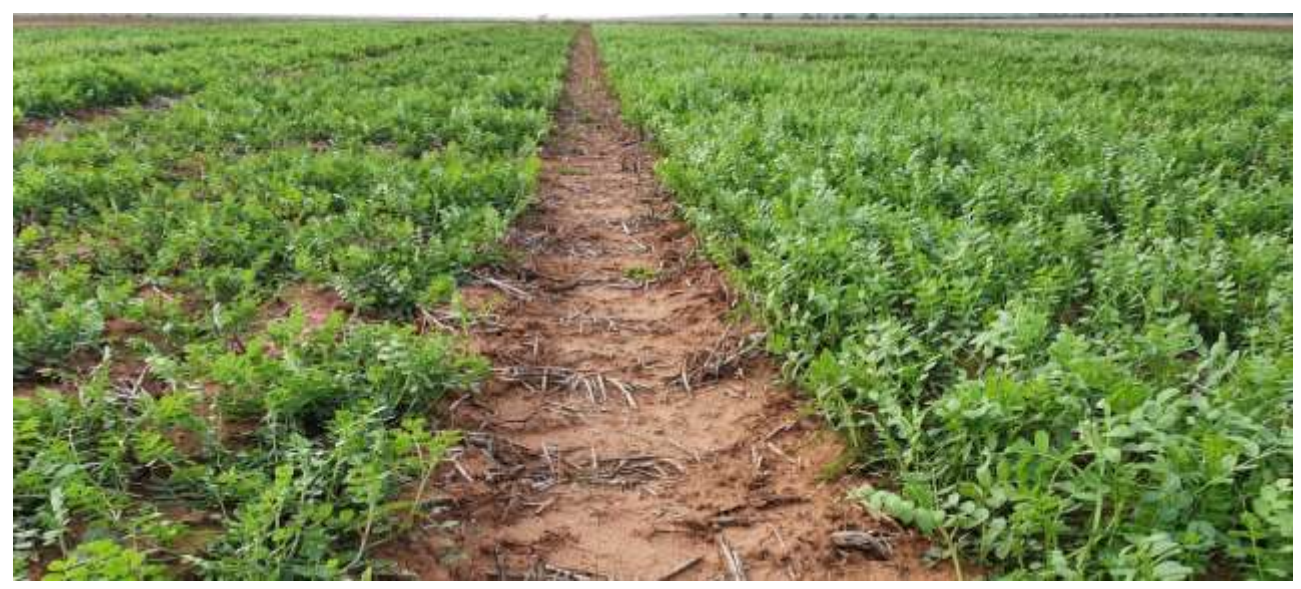
Figure 1. (L-R) Morava (nil treatment) and Morava + gibberellic acid at 20 g/ha, seven days after application.

When analysed alone, there were differences in DM production at Hart between vetch varieties trialed. Morava was lower yielding (1.88 t DM/ha) when compared to Timok and Studenica which had a yield average of 2.09 t DM/ha and 2.10 t DM/ha, respectively (Figure 3).