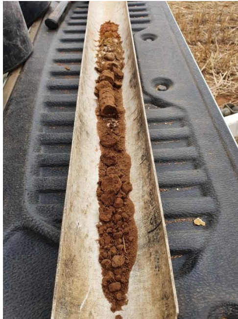
Pictured: Soil cores from near Snowtown (left) and Spalding (right).