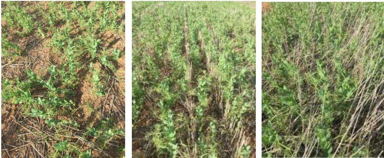
Figure 3. (Left to right) PBA Wharton field pea sown in the strategic, no-till and disc treatment taken on 27 th August, 2018.

There were significant differences in plant establishment among the seeders. In general, the no-till treatment had the highest plant establishment at 14 plants/m 2 compared to disc and strategic however, they were only reduced by 5 and 3 plants/m 2 , respectively (data not shown). The images below capture these differences, with more uniform plant establishment in the no-till compared to the strategic (prickle chained post seeding) and disc treatments (tall stripper front stubble).