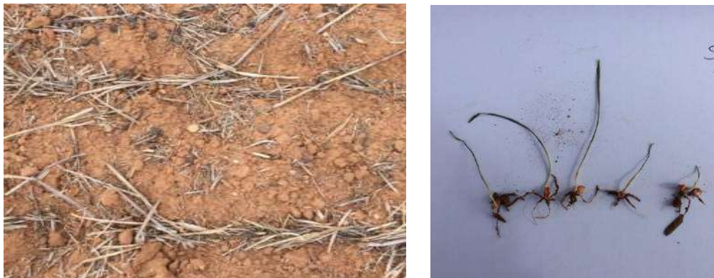
Figure 2. Plot of Scepter wheat sown 21 st March (left) and plants removed from the plot (right) taken on 22 nd May, 2018.

Achieving good plant establishment has been a challenge at Booloroo, particularly from March sowing dates. All four times of sowing were irrigated to achieve germination. Due to the lack of rainfall and high soil temperatures during March and April, times of sowing one and two appeared dead on the surface by the end of May. However, below the soil surface the coleoptile (section above the seed) remained alive (Figure 2) in the majority of plants. In early June the site received 30 mm across 10 days and many plants regenerated along with a secondary germination. At the final establishment count the plants populations were 67, 84, 111 and 136 plants/m 2 across time of sowing one to four.